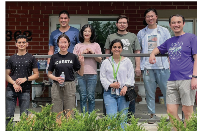
The GoogleServe Team