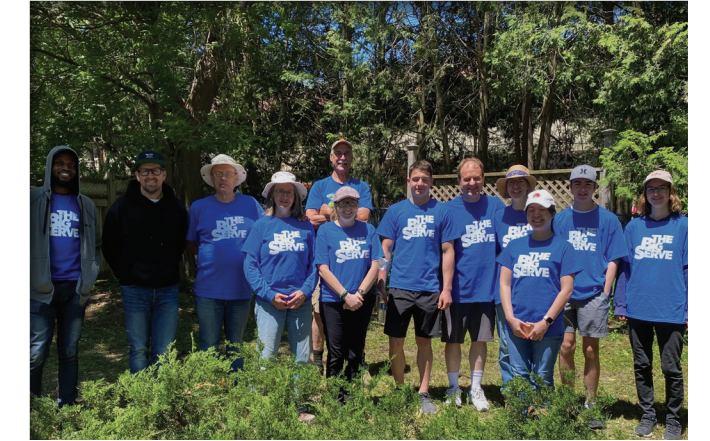
The Creekside Church BigServe Team