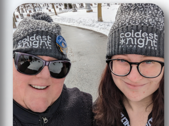
Team Tea Time