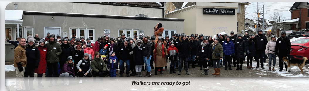
Walkers are ready to go!