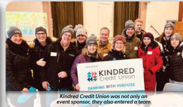
Kindred Credit Union was not only an event sponsor, they also entered a team