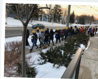
Walkers head out for their 5km walk from SHOW