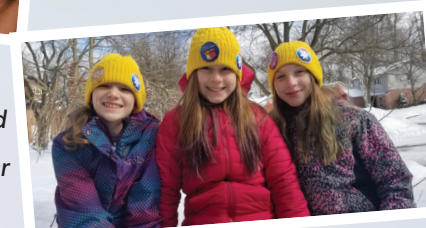
Members of the Westvale Warmhearts setting out for their walk