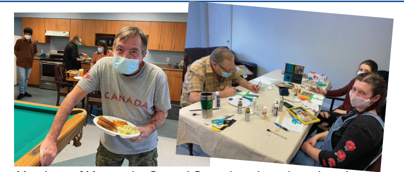
Members of Mennonite Central Committee have introduced a "Reclaiming Beauty" program where residents are using unwanted household items to create new works of art.

It's because of your donations to the Tenant Wellbeing Support Fund and ongoing support from SHOW monthly donors that we are able to host more in-person events, like our most recent community lunch. After 2 long years SHOW residents are looking forward to reconnecting with their SHOW family.